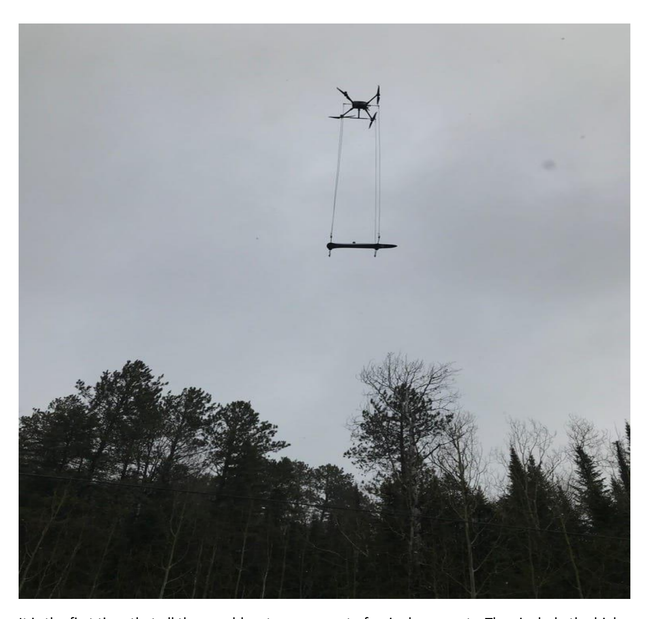
It is the first time that all these gold systems are part of a single property. They include the high-grade Combined Mine, Mascotte Mine, Trojan Mine, Boulder Mine, Terrell Occurrence, OGS Occurrence, Kuluk Occurrence & the Young's Bay Occurrence, etc.